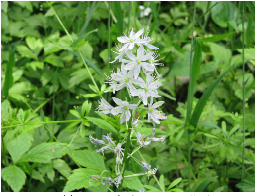
Wild Hyacinth Camassia scilloides

Fleabane, daisy ..... Erigeron annus Harbinger of Spring ..... Erigenia bulbosa Horse nettle ...... Solanum carolinense Honewort ...... Cryptataenia Canadensis